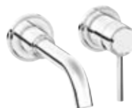
19 291 001 wall mount vessel trim 2 GROHE StarLight® chrome also available in ENO