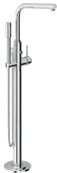
32 227 001 7° floorstanding tub filler 1* GROHE StarLight® chrome