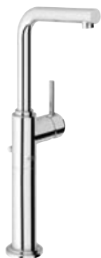
32 655 001 7° deck mount vessel GROHE StarLight® chrome also available in ENO