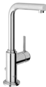
32 006 001 7° swivel spout lavatory centerset GROHE StarLight® chrome also available in ENO